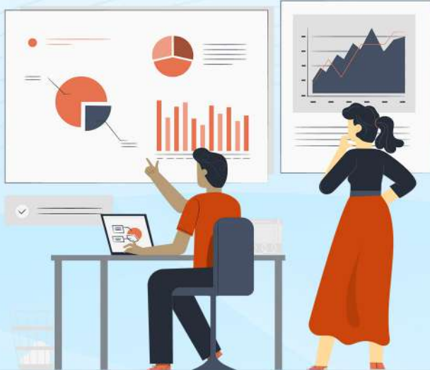
R PROGRAMMING WORKSHOP

The department of Information Technology Conducted 2 workshops in Multicon-w: